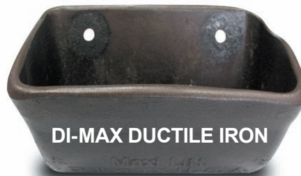
DI-MAX DUCTILE IRON

Capacity: 67.0 cubic inches Size: 8x5 AA