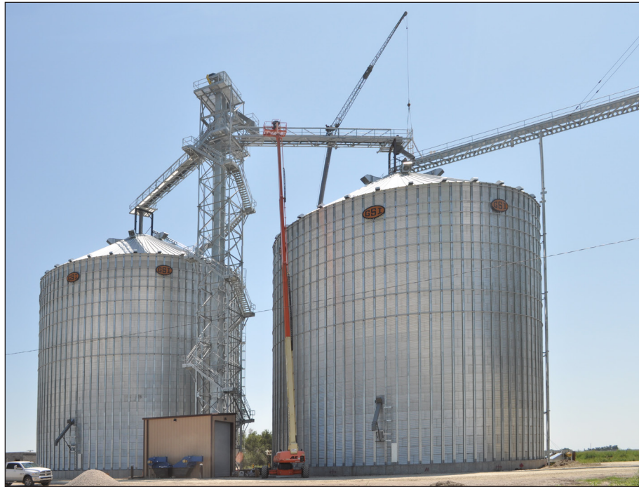
Ground-level view of the two new GSI 500,000-bushel tanks with 15,000-bph Warrior legs, conveyors, tower, and catwalks.

The area of central Kansas surrounding the town of Stafford has produced some outstanding crop yields in recent years, despite weather-related problems in other parts of the state.