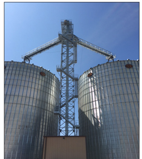
Closer view of the new 15,000-bph Warrior leg and overhead drag conveyors, with Warrior tower equipped with wraparound stairs.