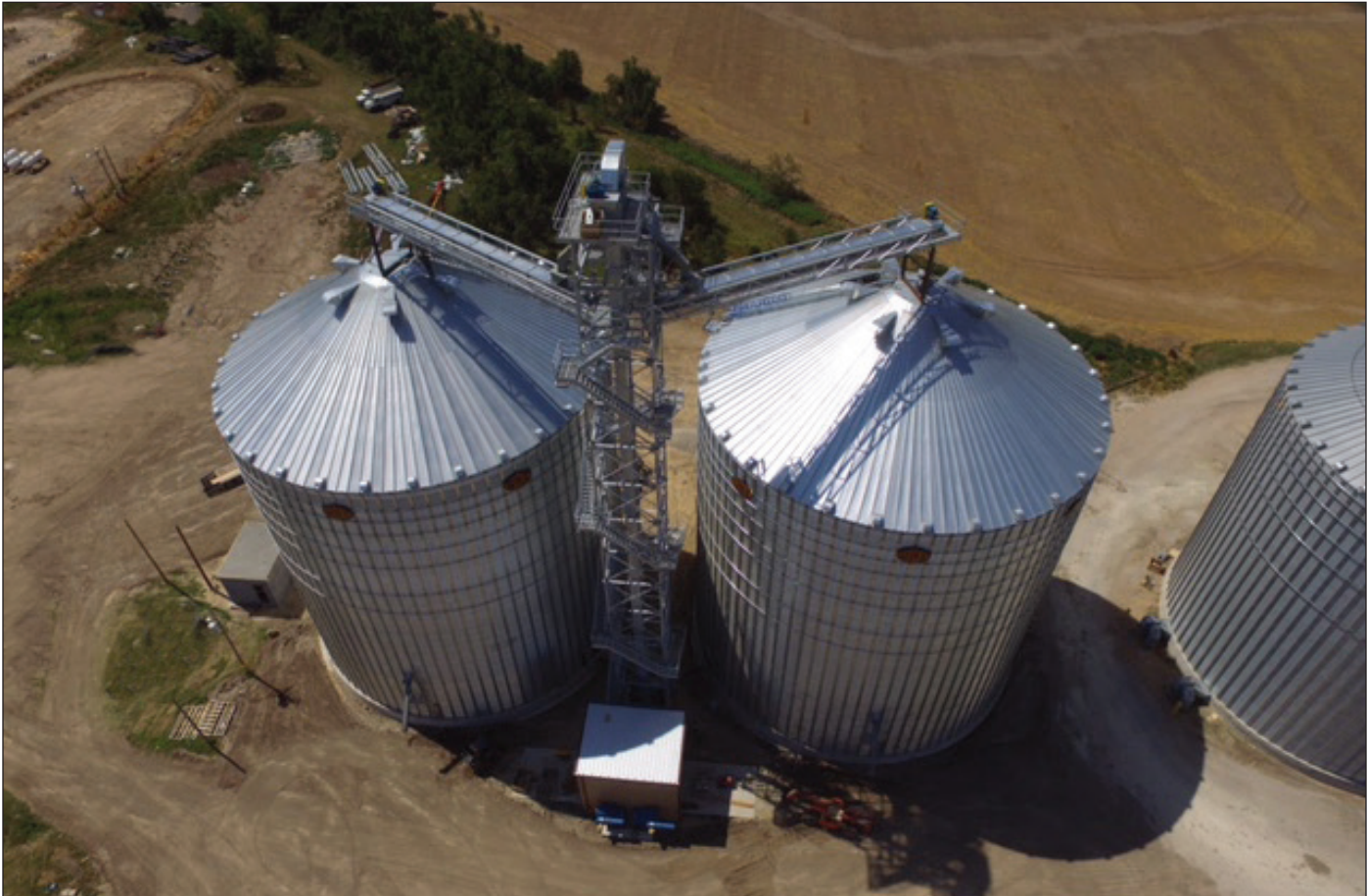
Kanza Cooperative's new 1-million-bushel steel annex at its branch elevator in Stafford, KS.

NEW STEEL ANNEX EXPECTED TO REDUCE NEED FOR GROUND PILES, LABOR