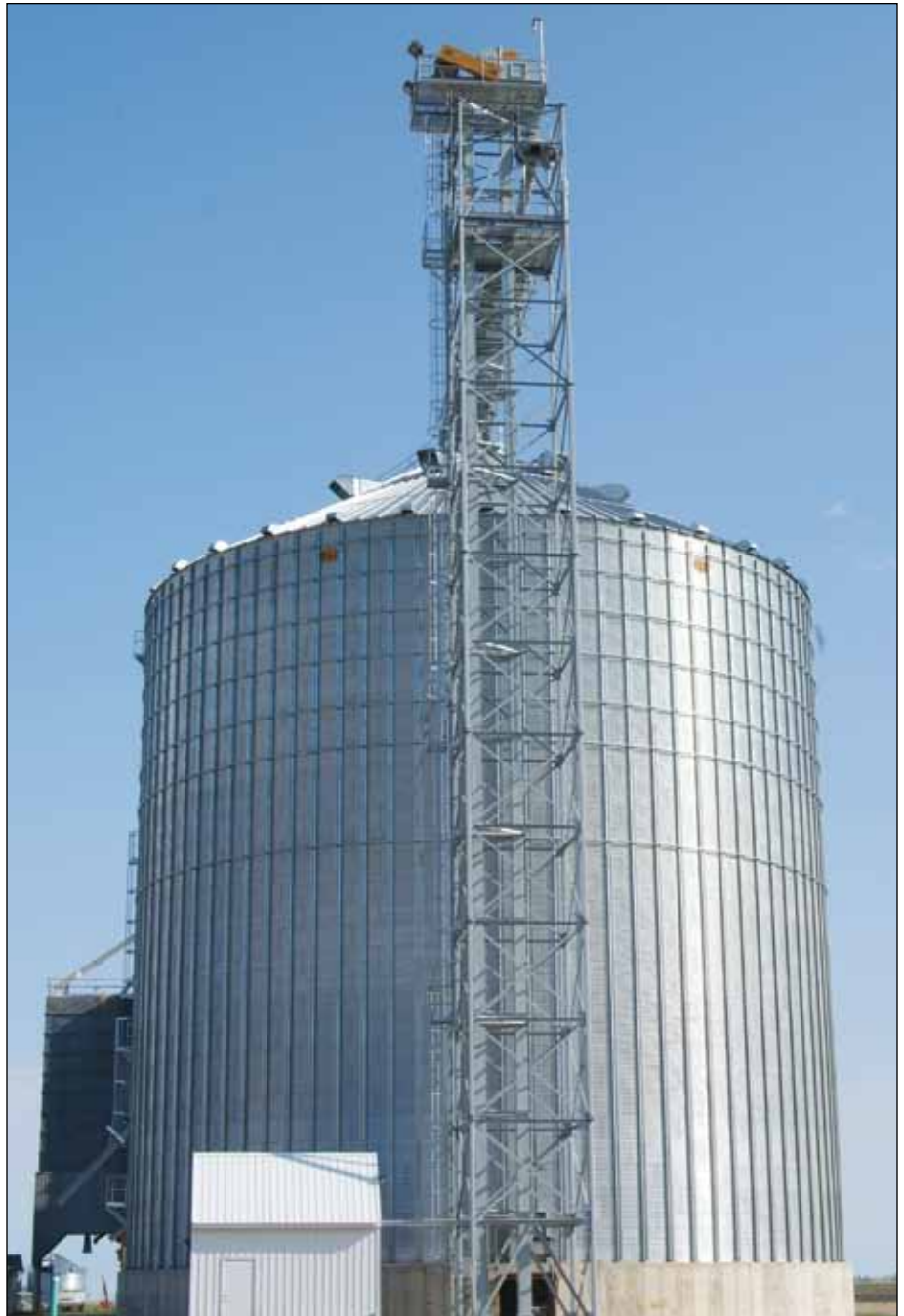
New GSI 500,000-bushel steel tank and 15,000-bph GSI leg at Ramona, SD.