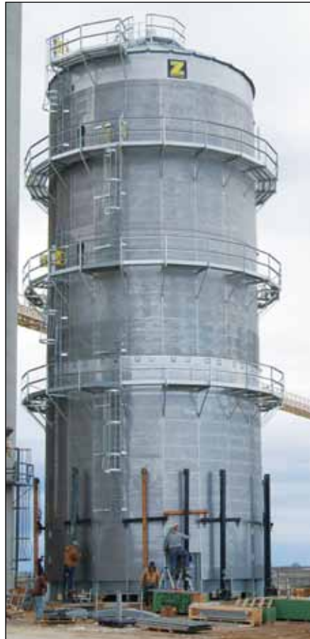
New 10,000-bph Zimmerman tower dryer under construction at Madison early in May 2011.

• Peterson Contractors Inc., Reinbeck, IA (319-345-2991), did the