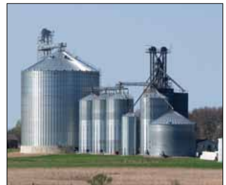
Overall shot of the branch elevator at Ramona.

The flat-bottom tank has outside stiffeners, a 16-inch GSI sweep auger, ▶