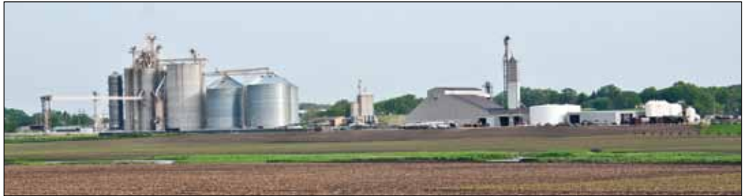
Madison Farmers Elevator Co.'s headquarters elevator in Madison, SD, on a day when a lot of grain is moving. New tank is in the center foreground of the cluster of steel tanks.

Madison Farmers Elevator Co., Madison, SD, in 2010 installed nearly identical 500,000-bushel corrugated steel GSI tanks at each of its two locations.