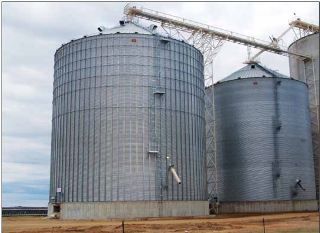
Closeup of the new GSI 500,000-bushel tank at Madison showing sidedraw and overhead 20,000-bph Hi Roller enclosed belt conveyor.